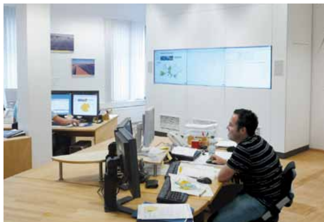
Comprehensive overview: control centre with continuous data analysis and target/actual comparison

Place your trust in our staff's expertise, and do not hesitate to ask us for further advice or assistance. If you require further information about our Phoenix Monitoring and Maintenance Services, please contact monitoring@phoenixsolar.com . We shall be delighted to draw up a maintenance analysis tailored to your solar power plant.