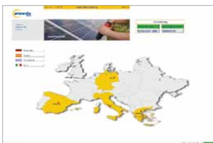
Activity recognition using 10-minute intervals