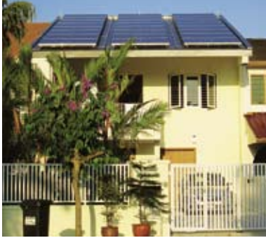
Singapore's first modern Zero Energy Home (ZEH)

"Phoenix Solar helped us to prove the feasibility of a zero-energy home without compromising on comfort, using today's readily-available technology."